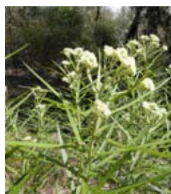
Alpine Rice Flower (above left) Fringe Lily (above right), Dogwood (left)

At the lookout, stay behind the barrier as there is a steep drop beyond.