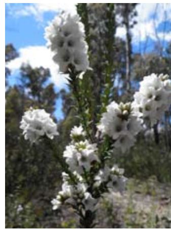
Austral Bugle (left) and Drumstick Heath (right)