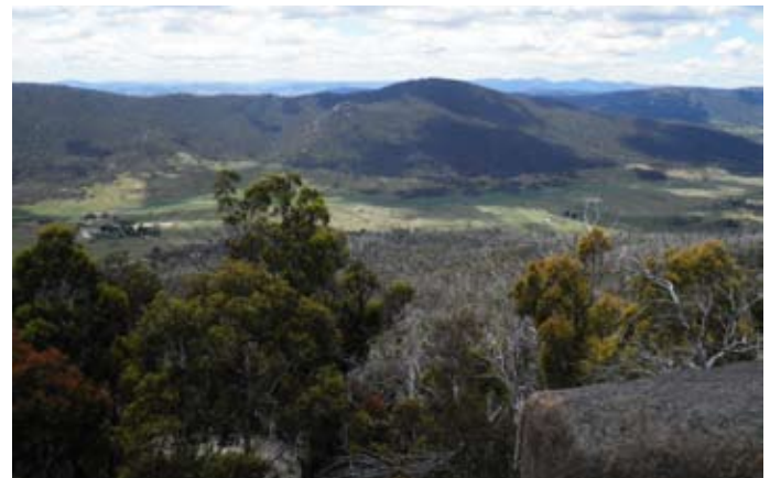
Orroral Valley (above) and granite boulders (below) from the end of the track.

The Granite Tors track starts from the Cotter Hut Road/Orroral management trail, initially passing through Snow Gum, Black Sallee, tea tree and Snowgrass. As you climb, the forest changes to Ribbon Gum, Mountain Gum, Candle Bark and Broad-leaved Peppermint.