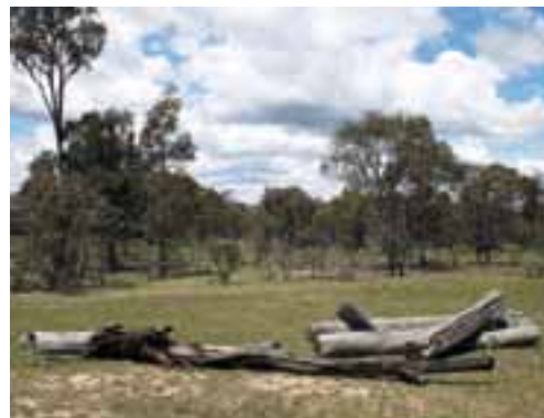
2000 tonnes of large dead wood placed in scattered or clumped arrangements in the Sanctuary & Gorooyarroo Nature Reserve are being studied.

The fact that so little is known about these iconic woodlands, was the impetus for an innovative research project that began here in 2004. A recent development is the establishment of the Mulligans Flat Woodland Sanctuary—485 hectares of Mulligans Flat Nature Reserve enclosed by a predator proof fence. This will allow the reintroduction of locally extinct native animals that are vulnerable to predation by foxes and cats.