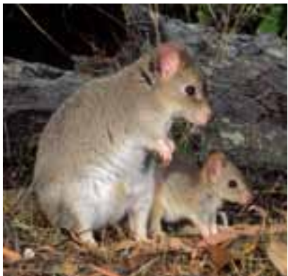
Small mammals such as this Tasmanian Bettong, are the 'ecosystem engineers' of the woodlands dispersing seed and spore and aerating the soil.

Mulligans Flat and Gorooyarroo Nature Reserves are part of Canberra Nature Park, a series of over 30 reserves throughout suburban ACT. Canberra Nature Park defines Canberra as the bush capital, providing opportunities for residents to enjoy nature literally on their doorstep. Treasures of national significance are conserved here including the largest most intact and contiguous area of Yellow Box—Blakely's Red Gum Grassy Woodland in public ownership. Box-gum woodland is a critically endangered ecological community, having been cleared, modified and grazed since the 1820s across its original range. Although woodlands in this region were also grazed and frequently cleared to some extent, the now protected reserves still retain significant ecological values.