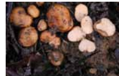
Underground truffles are being studied in the Sanctuary. They are eaten by native animals and so the spores are spread.

In addition to the fence, another obvious feature of the Sanctuary is 2000 tonnes of large dead logs distributed in patterns that are similar to fallen trees. Plants, animals and the immediate environment adjacent to the logs are being studied.