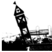
Town and District Parks