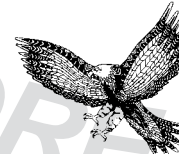
Namadgi National Park