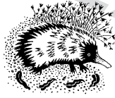
Canberra Nature Park