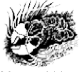
Murrumbidgee River Corridor

The Explore Program is growing with the addition of a Feature Walk. Each Feature Walk will profile one of our great self-guided walks, which allow you to explore different parts of Canberra's parks and natural heritage at your leisure.