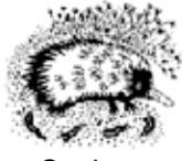
Canberra Nature Park