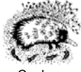
Canberra Nature Park