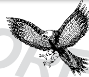
Namadgi National Park