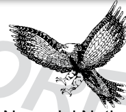
Namadgi National Park