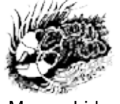
Murrumbidgee River Corridor