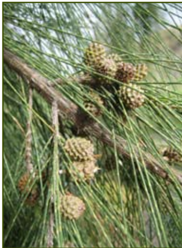
River Oak cones on female tree