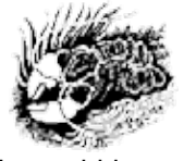
Murrumbidgee River Corridor

The Explore Program is growing with the addition of a Feature Walk. Each Feature Walk will profile one of our great self-guided walks, which allow you to explore different parts of Canberra's parks and natural heritage at your leisure.