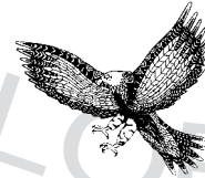
Namadgi National Park