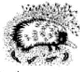
Canberra Nature Park