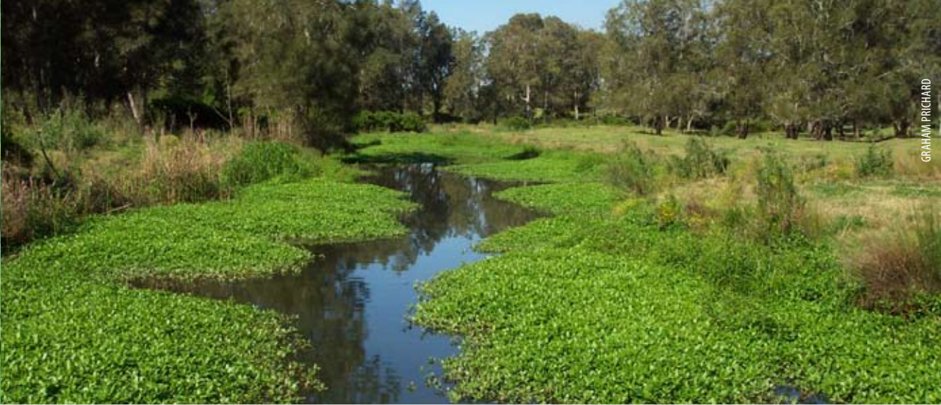
Alligator weed plant material can be transferred from gardens and establish in waterways