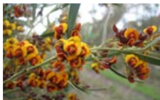
Narrow-leaf Bitter Pea