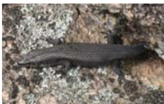
Black Rock Skink