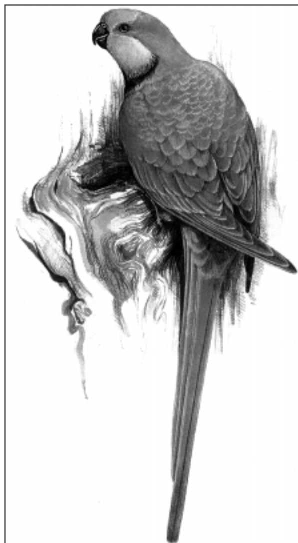
Figure 1: Male Superb Parrot ( Polytelis swainsonii ).

To the north and adjoining the two NSW breeding regions, P. swainsonii is found predominantly during the winter months. This wintering area includes the Namoi River between Narrabri and Gunnedah, the Castlereagh River between Coonamble and Gilgandra, and the districts around Hermidale, Tottenham, Warren and Parkes. Breeding has not been confirmed in this area (Webster and Ahern 1992).