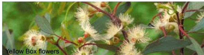
Yellow Box flowers

Front cover: Chapman Primary School students, Cooleman Ridge park carer and Parks, Conservation and Lands Community Programs Officer working together to restore Cooleman Ridge to its former woodland condition as described in historical records.